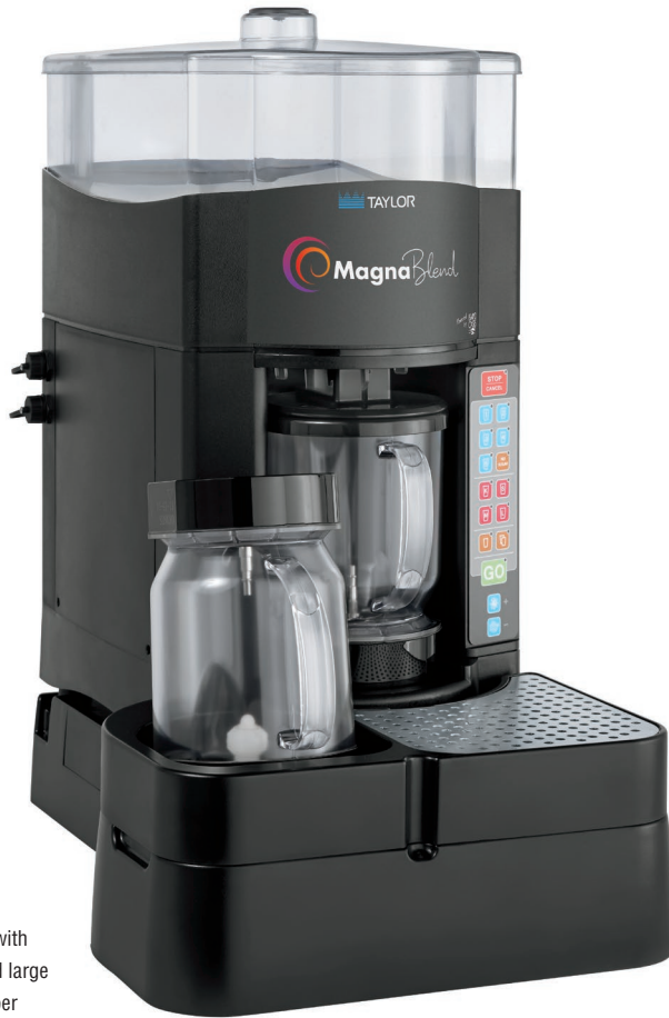
Shown with standard large ice hopper